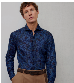
Premium 2150/15 FS82