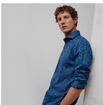
Premium 4390/17 XR82