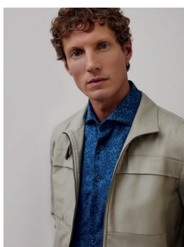
Premium 4390/17 XR82 2206/22 XS1S