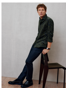
Premium 2103/25 XS82