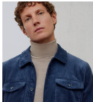
Premium 371/27 HAIO 2208/17 XO7K