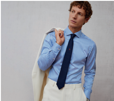
Premium 1186/14 F682