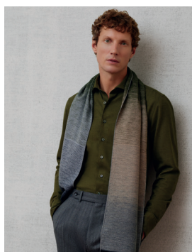
Premium 2394/46 XR82 178/48 LUIS