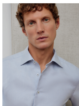
Premium 1188/11 X687