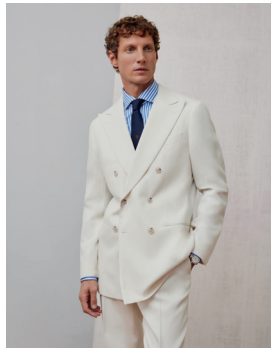
Premium 1186/14 F682